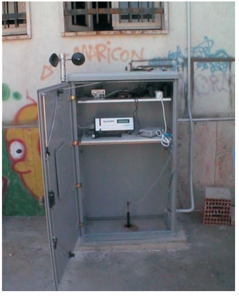
Figure 2: Monitoring station for radon in soil gas suited with with GSM

Belonging to the activity of technical and administration of Ente Provincia. The objects will have in each case not negliable scientific value, that put the Councellorship of the territory surrounding Ragusa and Civil Protection of the Regional Authority Province of Ragusa in a leadership position. The Radon Evaluation Monitoring Network of Provincia Ragusa is actually set up with three stations, located in Ragusa, Modica and Sicily (Figure 1)